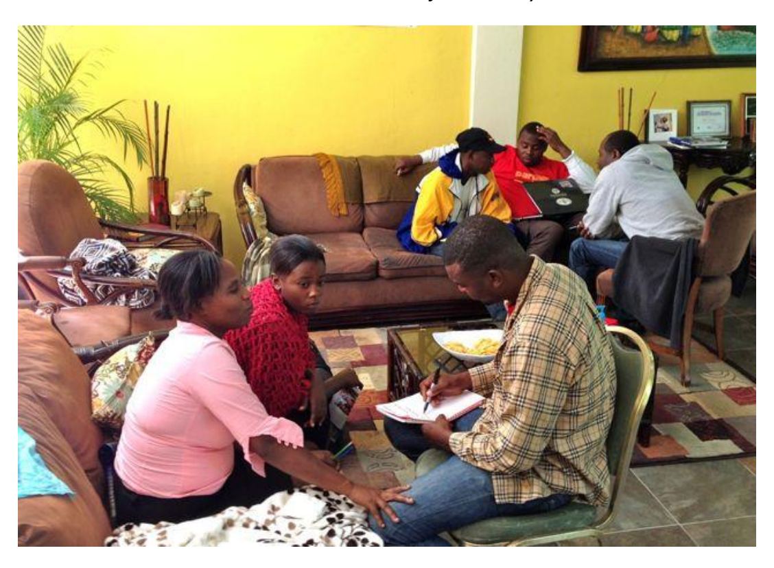
Small groups, divided by different schools, determine a list of things they can do to help students achieve these characteristics