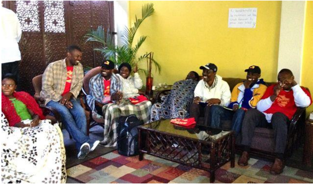
This group has a great rapport, a fact that improves participation and energizes us to work together