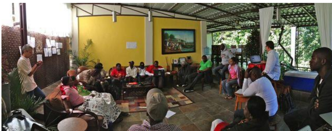
Large group discusses characteristics they hope to cultivate in students

Photos (to view a separate photo report from this meeting, click here ):