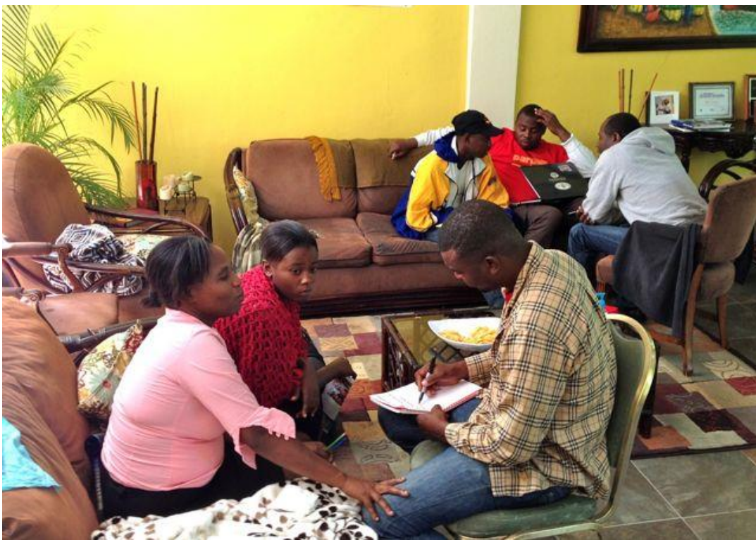
Small groups, divided by different schools, determine a list of things they can do to help students achieve these characteristics