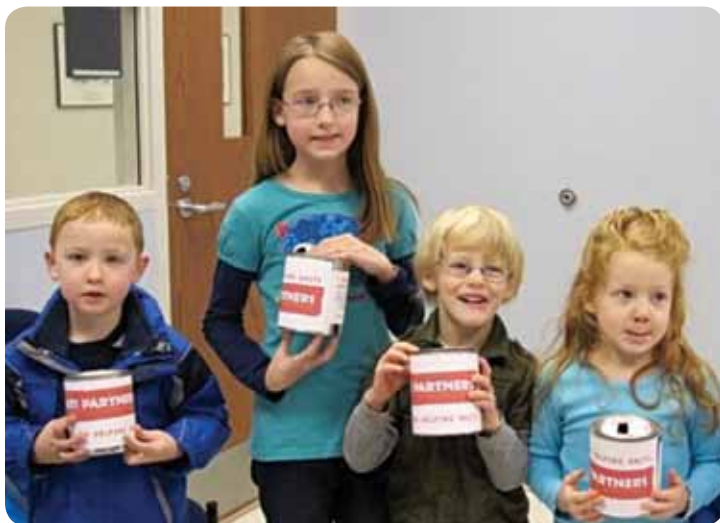
Students at Longfellow Elementary School in Wheaton, Illinois, raise support for education in Haiti.

By bringing together churches, schools, businesses, and individuals from all walks of life, the Partners program gives opportunities for new light. Relationships among Haitians and North Americans are being built on learning, respect, and mutual growth, which gives us hope that our shared destiny will be brighter.