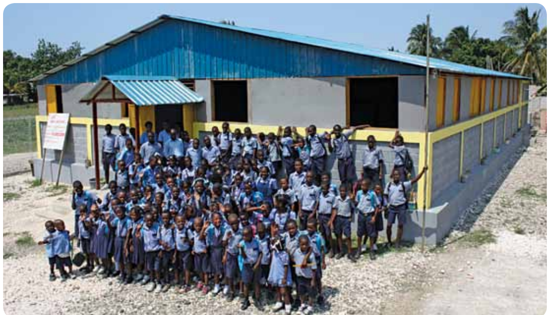
Haiti Partners has rebuilt four Partner Schools since the January 2010 earthquake.

In the coming year , progress can continue with quality teacher training, inspiring materials, support for meal programs, and improvements to facilities. We will complete phase 1 of the Children's Academy. Working together with you, we can bring light to the shadows over education in Haiti, helping schools transform their communities and moving the country toward a brighter future.