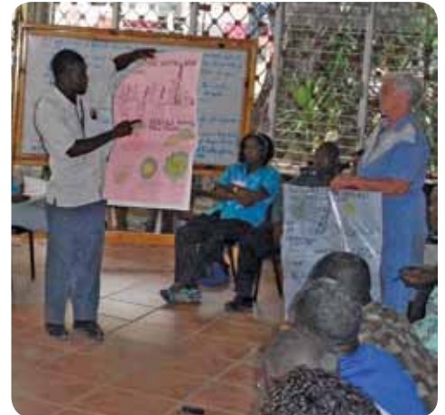
Four times a year, leaders from around the country gather for inspiration and training.

Through a three-year training for 35 community leaders, our Leaders program provides a brighter path for leaders to follow, one that emphasizes a servant-leadership approach. Participants learn to: (a) inspire others while discovering their own potential; (b) engage stakeholders to accomplish shared goals; and (c) nurture spiritual growth and a culture of mutual respect and trust.