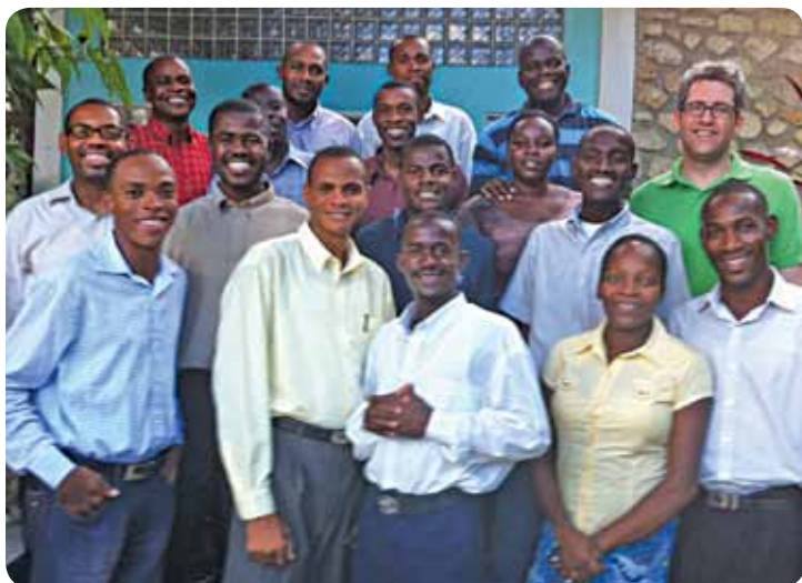
At the inaugural Micah Scholars retreat, young church leaders are excited to prepare for their first year of seminary.

In the coming year, with your support we can continue these efforts as we launch the Micah Scholars initiative. We welcome your prayers as we continue to support Haitian Christians in their service of the light-giving, transformational power of the gospel in their spiritual and physical lives.