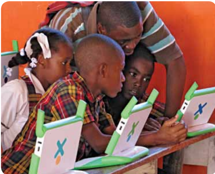
Great teachers bring learning to life.

In contrast, the Teachers program provides educators with tools to create great learning environments where students can shine. These methods prepare teachers to help students think critically, cooperate effectively, question constructively, and apply their learning locally to build a better Haiti.