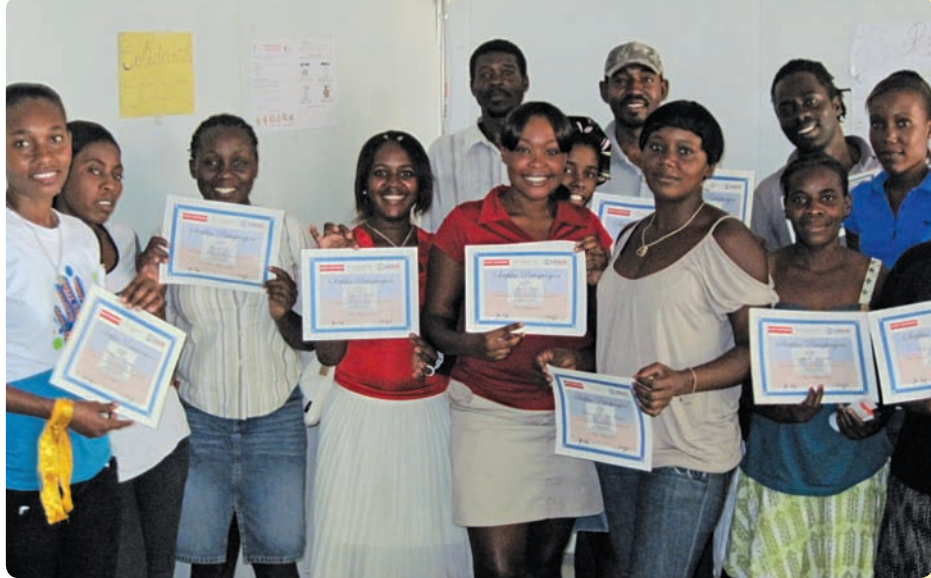
Some of the 1,000 educators who received certificates through Haiti Partners’ USAID-funded training this past year.

Educators learned participatory teaching and leading techniques as they studied the Haitian Constitution and their own civic responsibilities.