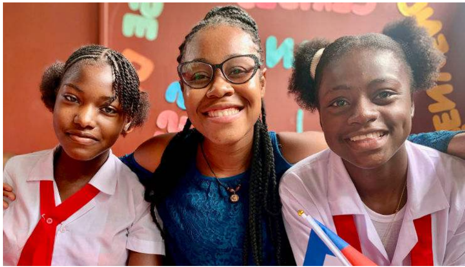
A Children's Academy teacher celebrates the school's reopening with two of her students.

84,760 service hours were provided by Children's Academy parents. Despite the insecurity, parents continued to engage at the school and in the community by providing service hours doing a variety of important tasks: working the permaculture gardens, tending school grounds, helping