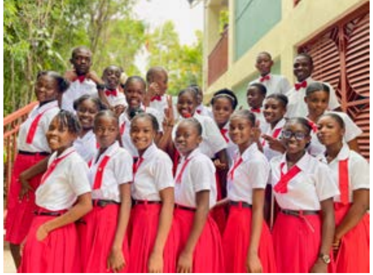
On the school's first try, 100% of Children's Academy 9th graders passed the national exam. This is an extraordinary achievement in Haiti where a typical passing rate is closer to 70%.

In July 133 parents graduated from Community Change Groups . The module was a modified version of the training, specifically focusing on the protection of children through positive discipline and "love in action." Community Change Groups provide parents the skills they need to be more loving to their kids and each other while achieving greater financial independence. Their goal is to strengthen families and